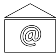
Send the form