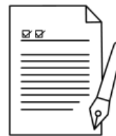
Fill the form