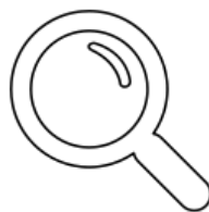
Inform & research